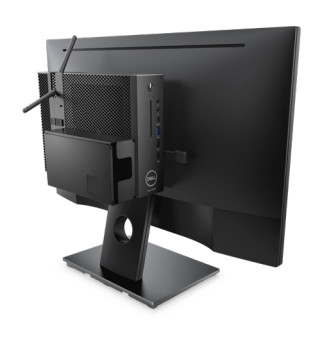
DELL ALL-IN-ONE MOUNT FOR DELL E-SERIES

Create desk space by mounting your system to select Dell E-Series displays