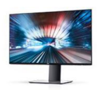
DELL 24 MONITOR | P2419H

Optimize your workspace with this efficient 23.8" monitor built with an ultrathin bezel, a small footprint and comfort-enhancing features.