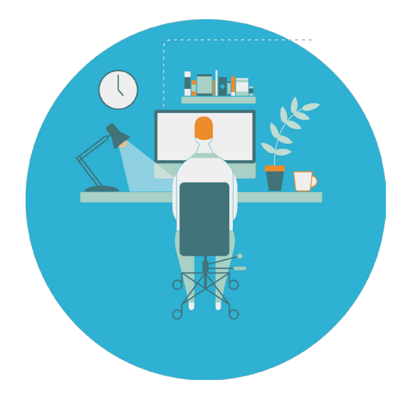
BENEFITS • Ease of use • Cost control

Many of the end user device problems are avoided with a simple to use, self-service portal that enables proactive dynamic response to requests. With the Snow end-user portal, end users can enroll devices 24/7 without involving the service desk. After enrolling, they can download internal and recommended apps and deploy corporate settings to their devices giving them an improved end user experience. For IT, this saves time, but more importantly, it enables control over what apps are licensed and downloaded.