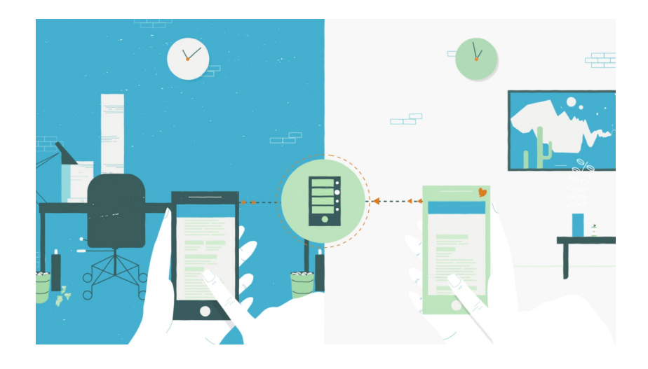
• Ease of use • Security • Information at your fingertips

Snow Device Manager integrates with email servers, firewalls, VPNs and other solutions to enable secure access to internal networks. Integrating with your existing infrastructure is cost effective and takes away the burden of managing dual access infrastructures. Combining device and app security with seamless functionality like Per-App VPN and user certificates gives a high level of security while not adding a hurdle for the end user.