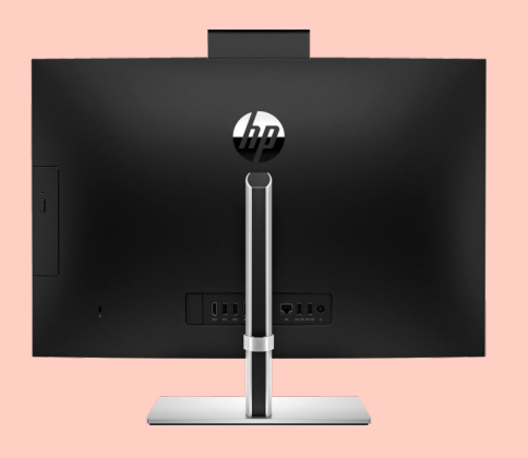
HP ProOne 440 G9 623X3ET