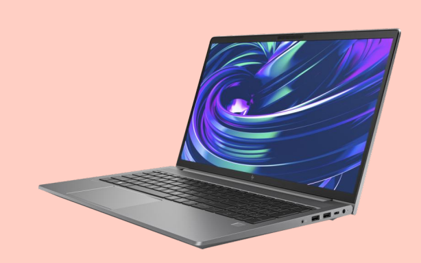
HP ZBook Power G10 98P47ET