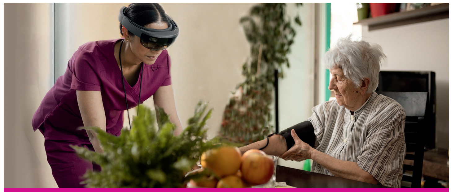
Trailblazing augmented reality technology to revolutionise care provision